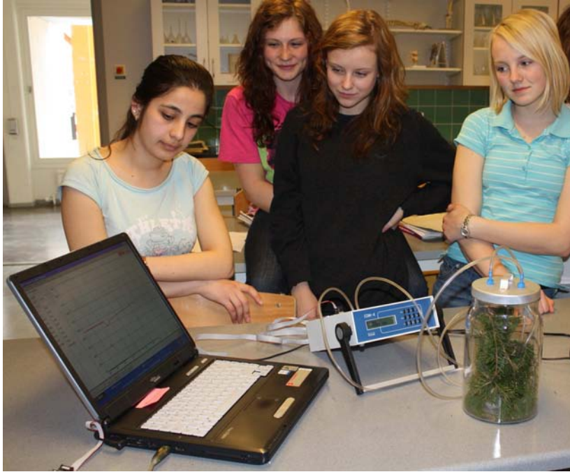
Figure 2. Indoor Measurements of photosynthesis and respiration in a spruce twig