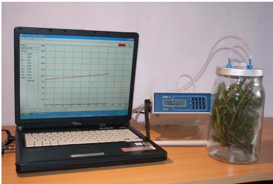
Figure 1. Measurement of photosynthesis and respiration in a spruce twig in low light; the carbon dioxide concentration increases.

Examples of issues that can be discussed in connection with the experiment.