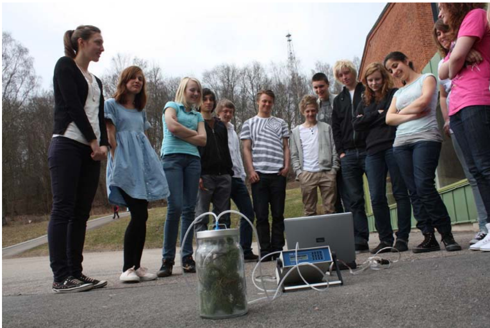
Figure 3. Outdoor Measurements of photosynthesis and respiration