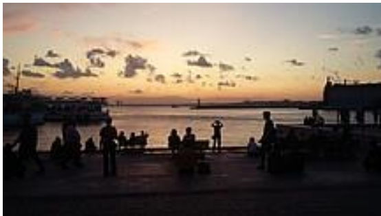
Marmara University, Turkey