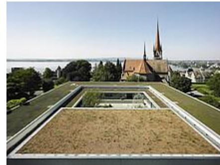
University of Teacher Education Zug, Switzerland