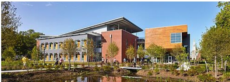
Virginia Wesleyan University, USA