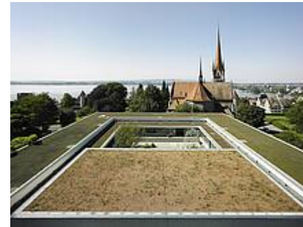
University of Teacher Education Zug, Switzerland